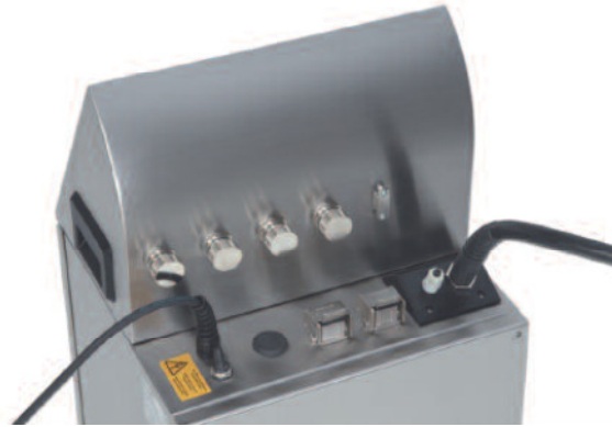
Multiple connections on the reverse

alphaJET into prints economically in high quality, at fast production speeds, with low maintenance and it is easy to operate.